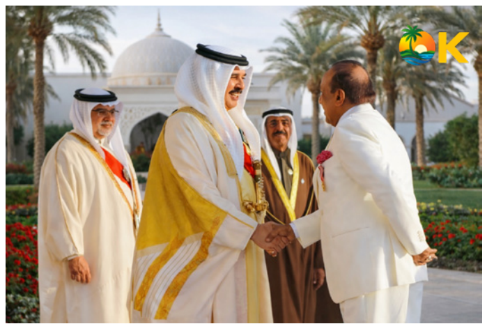
Ravi Pillai received Medal of Efficiency from the King of Bahrain